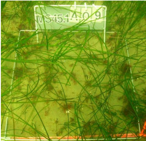
Eelgrass in January

Field work in January is far from routine in New England. With temperatures ranging from 1°F on January 24th to 62°F on January 31st and winds gusting most days to 25 knots, it's tough to schedule time on the water. It always seems that the coldest days are the calmest and the warmer days are riddled with fog and wind. The extreme temperature swings, snowstorms, downpours, and 60 knot gusts make January an ideal time to snuggle up to a cup of tea and start planning for spring fieldwork.