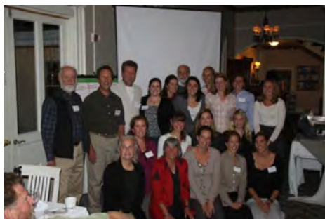
Nixon lab members